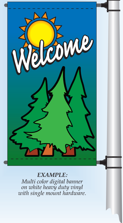
EXAMPLE: Multi color digital banner on white heavy duty vinyl with single mount hardware.